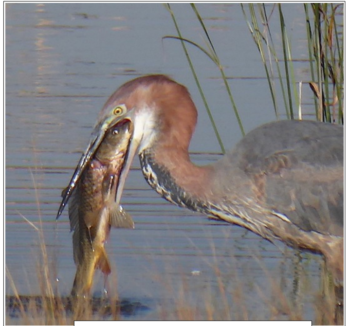
Goli Junior and catch stare it out